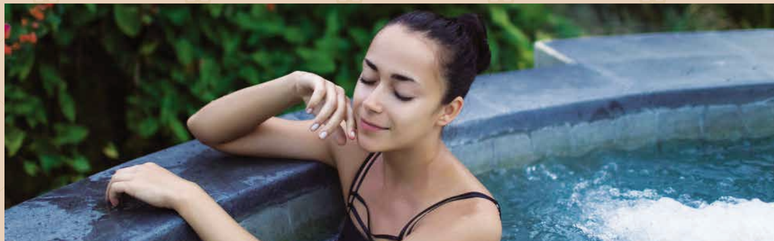
— JACUZZI —

A Double Height Cafeteria on the 10 th & 11 th floor overlooks panoramic views of the swimming pool & landscaped garden. The two floors also host over 25 curated luxury amenities that provide for each member of the family.