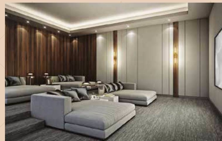
— MINI-THEATRE —