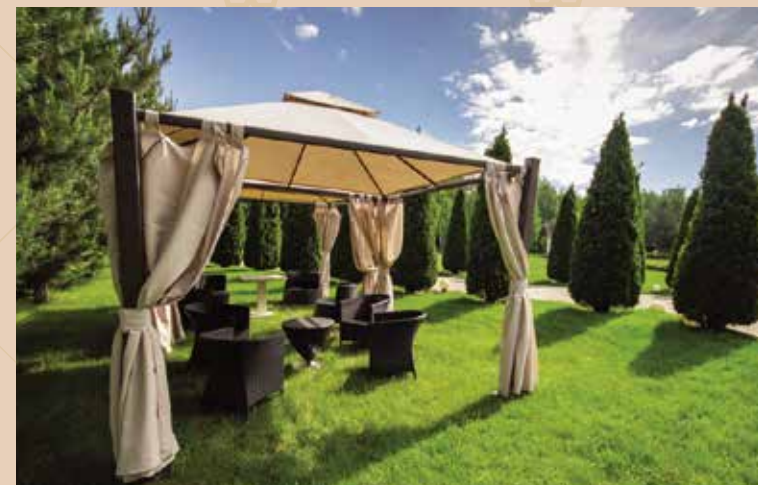
— GARDEN WITH CABANAS —