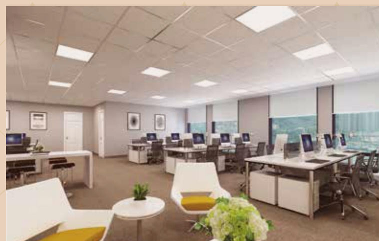
— BUSINESS CENTRE —