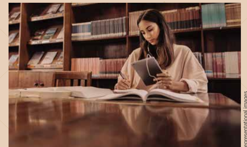
— LIBRARY —