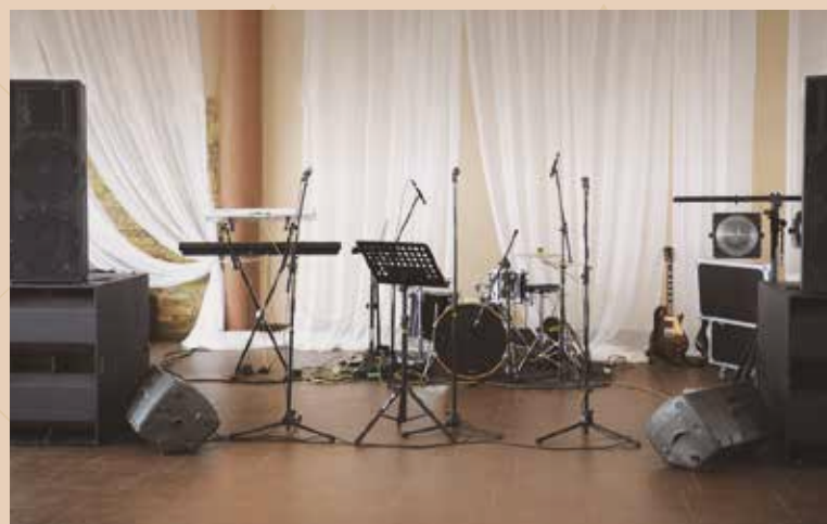
— MULTI-PURPOSE MUSIC STUDIO —