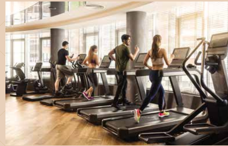
— GYMNASIUM —

An Exclusive Clubhouse to Unwind, Relax and Enjoy.