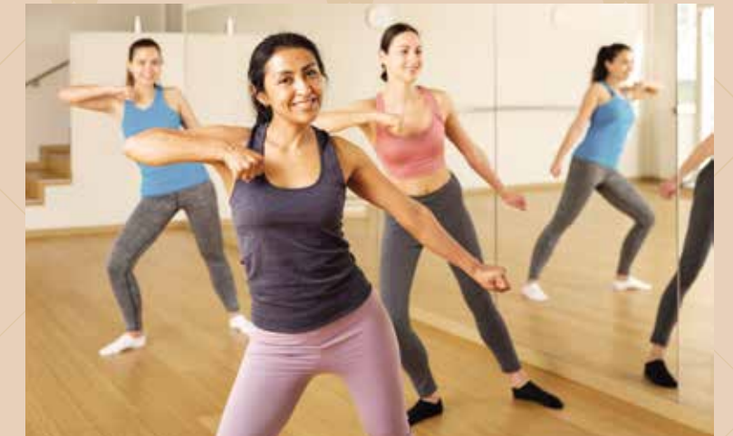
— DANCE & AEROBICS STUDIO —