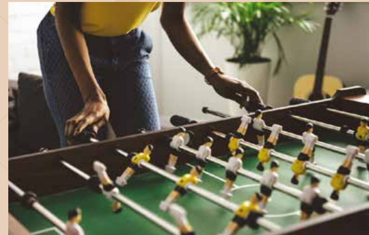
— INDOOR GAMES AREA —