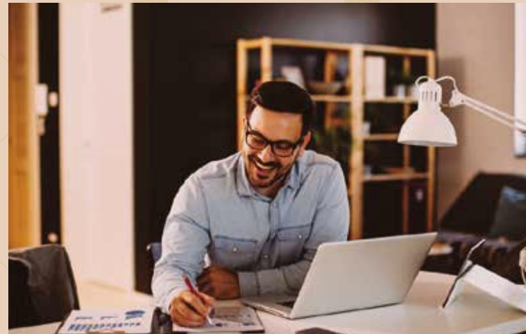
— BUSINESS LOUNGE —