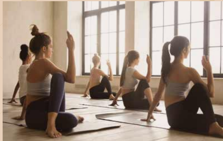
— YOGA & MEDITATION ZONE —