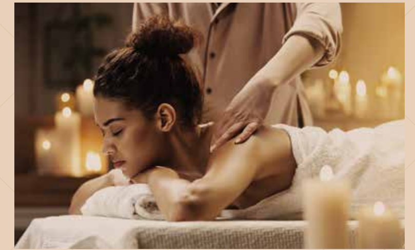
— SPA —