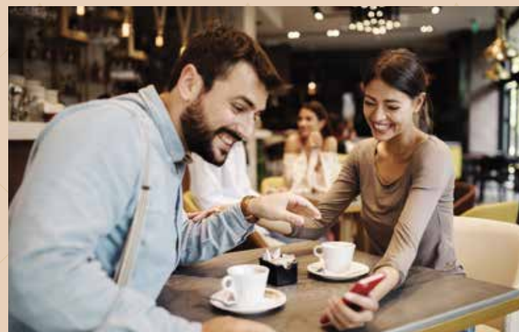
— CAFÉ —