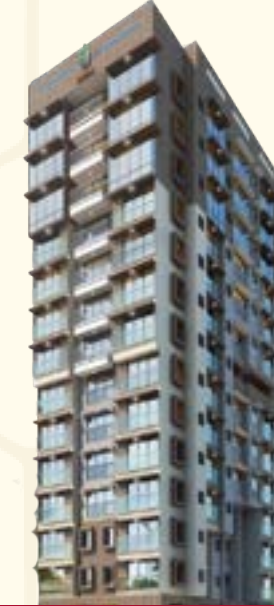
OM NEELKANTH DARSHAN (GHATKOPAR)