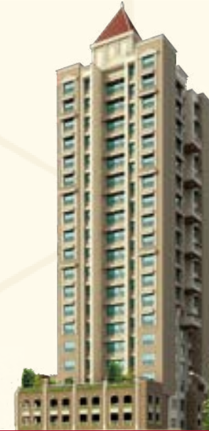
OM RESIDENCY (MULUND)