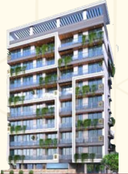
OM BHAGWATI (KOPAR)