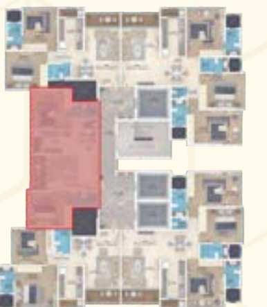
ISOMETRIC VIEW OF 2BHK