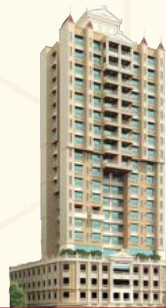
OM AMBE SMRUTI (MULUND)