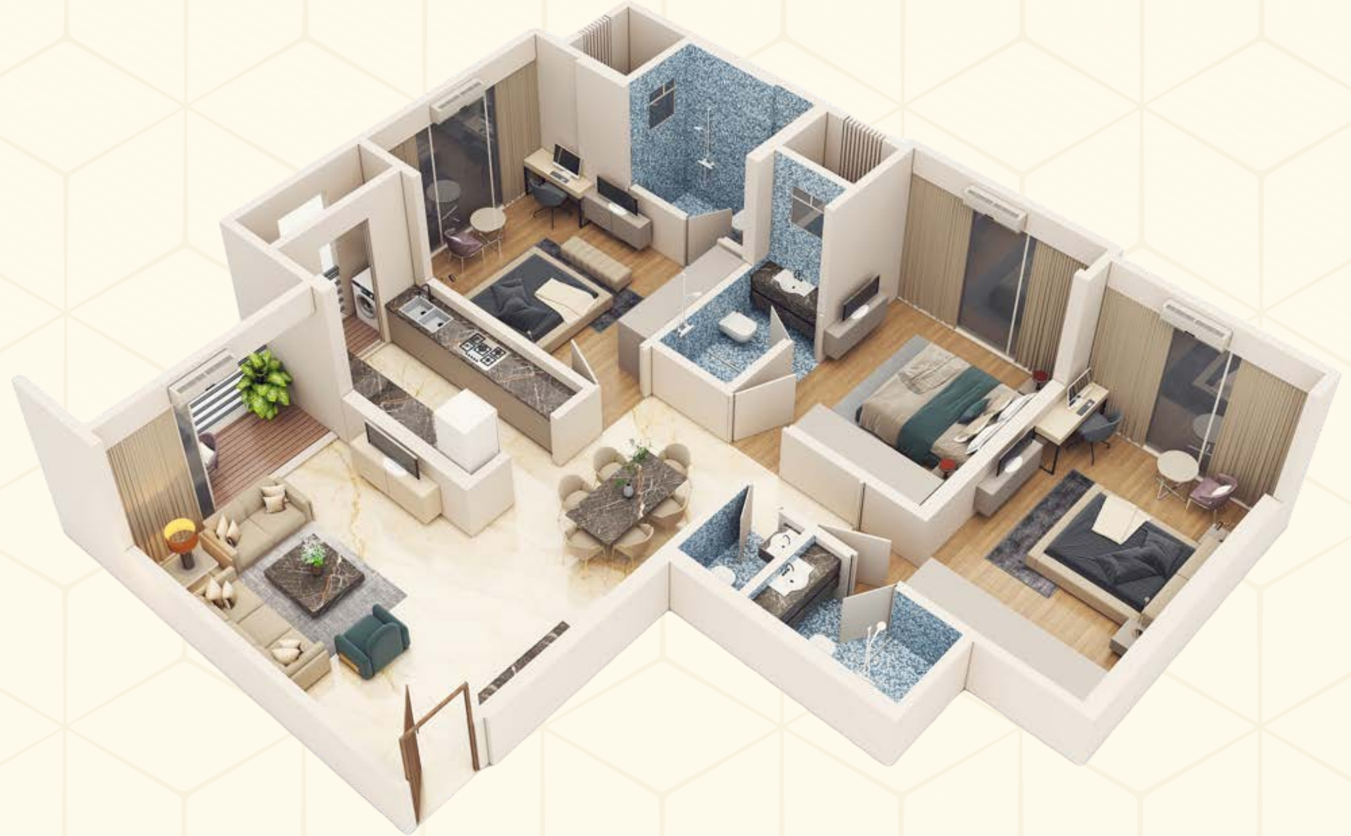
ISOMETRIC VIEW OF 2BHK