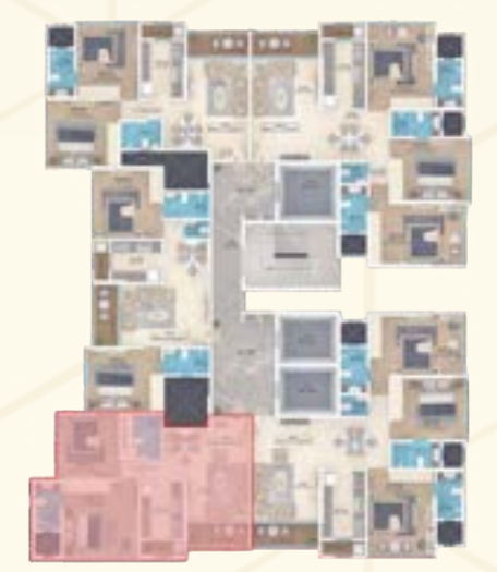
ISOMETRIC VIEW OF 2BHK