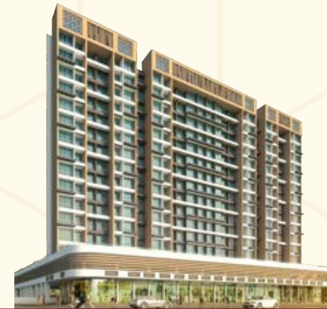
OM REGENCY (TALOJA)