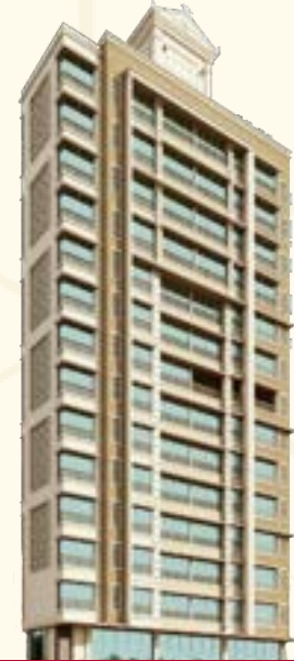
MANN MADHUVAN (MULUND)