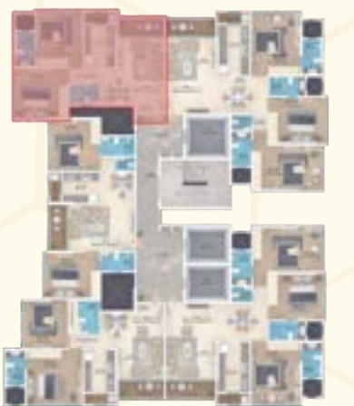
ISOMETRIC VIEW OF 2BHK