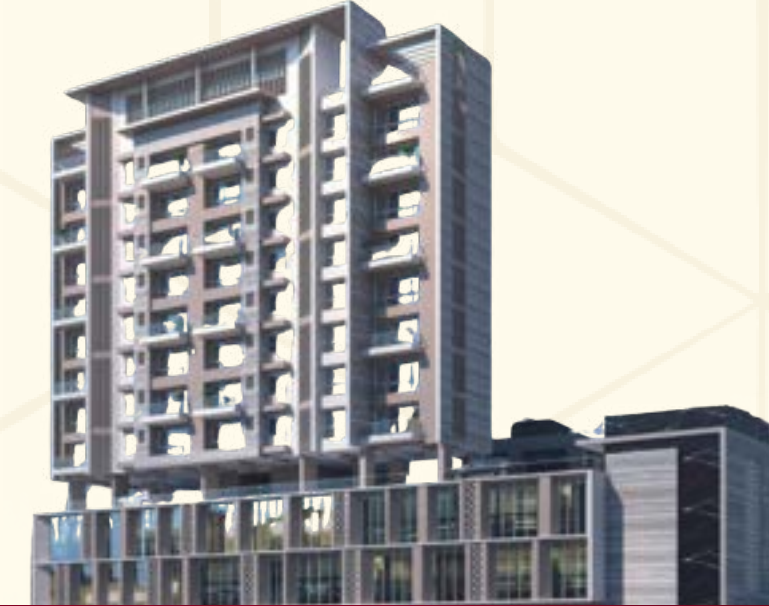
OM MAITRI (DOMBIVLI)