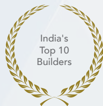
Kalpataru Limited The Construction Week Architect and Builder Awards 2016