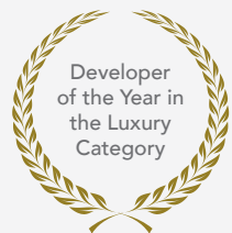
Kalpataru Limited Navabharat Realty Business Achievers Awards 2016