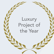
Kalpataru Amoda Reserve Golden Brick Awards 2018 - National Category