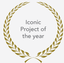
Kalpataru Vista The Realty Plus Excellence Awards 2018 - North