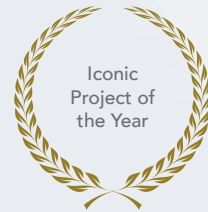
Kalpataru Avana Realty Plus Excellence Awards 2018