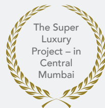
Kalpataru Avana The Times Real Estate Icon Award 2016