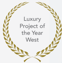
Kalpataru Avana 11 th Annual Estate Awards Franchise India 2019