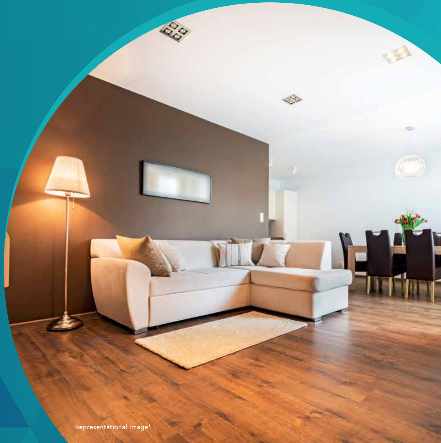
Representational Image 1