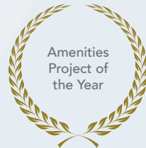
Kalpataru Jade Residences Golden Brick Awards 2018 - Zonal West Category