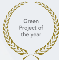
Kalpataru Sparkle The Realty Plus Excellence Awards 2018