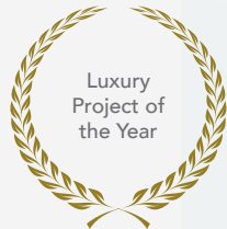
Kalpataru Jade Residences The Realty Plus Excellence Awards 2018