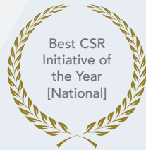
Kalpataru Group Golden Brick Awards 2019