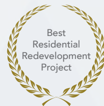
Kalpataru Sparkle Asia-Pacific Property Awards 2015